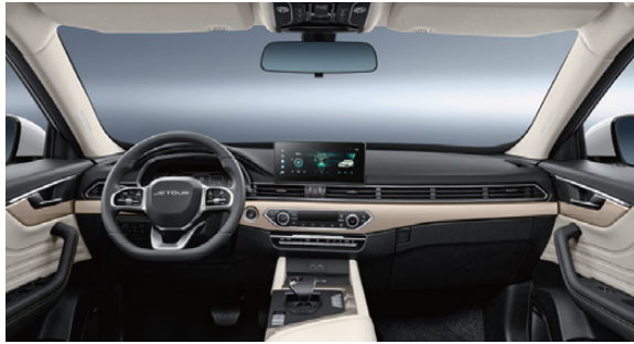
Black and gray