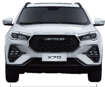
Overall width : 1,900