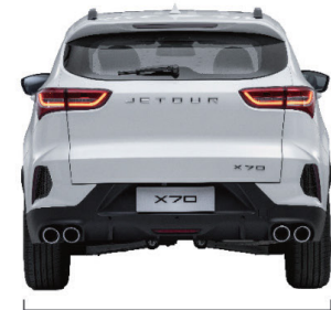
Wheel tread : 1,900 Wheel tread : 15 (front/rear) - 1,563/1,577