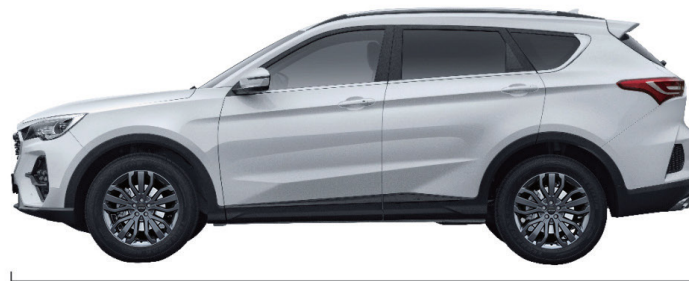
Wheel base : 2,720