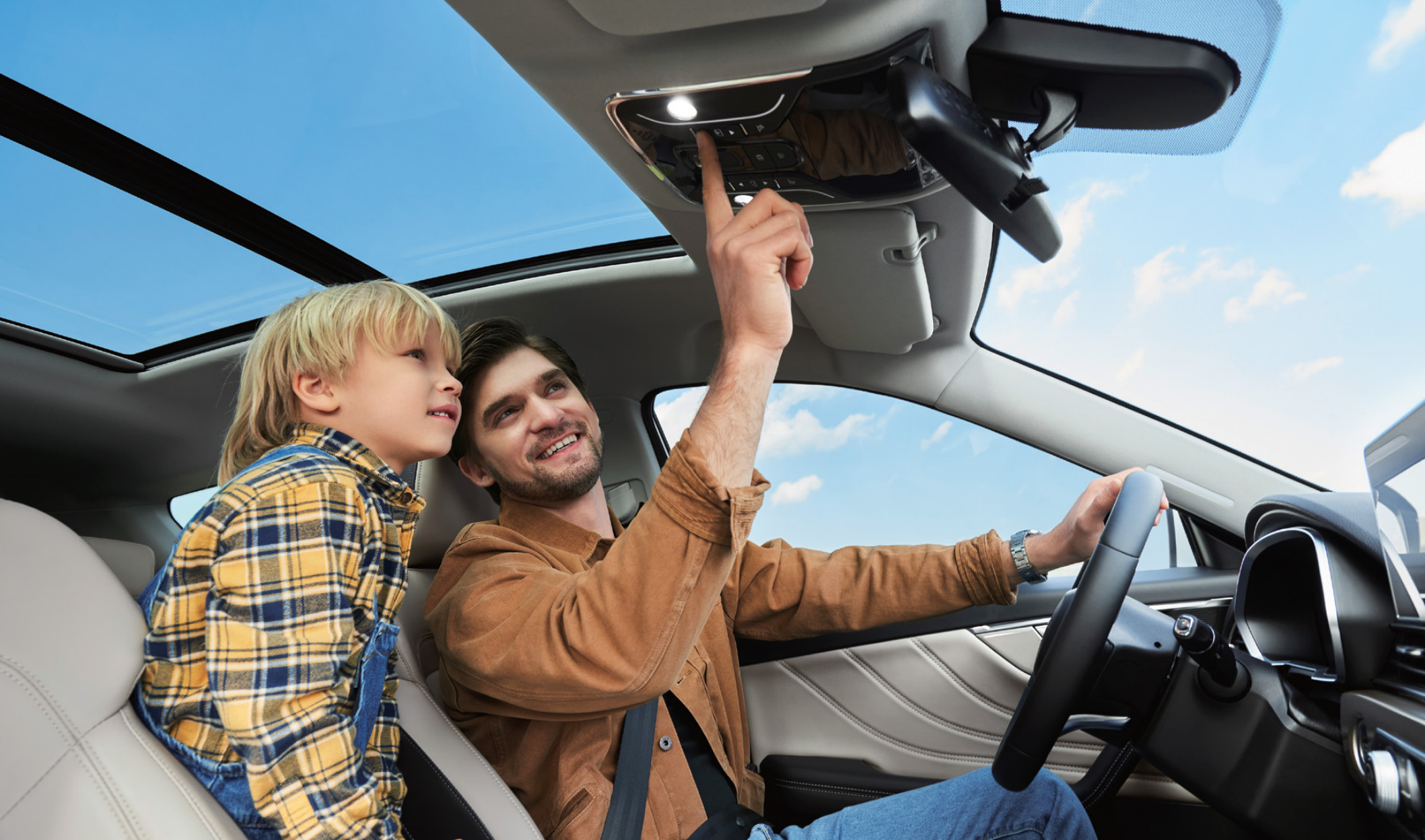
The X70 model with optional equipment is shown here.